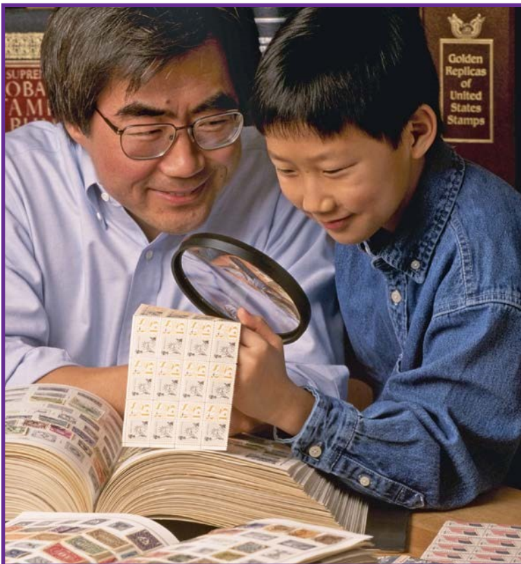
A boy uses a magnifying glass to look at stamps in his collection.

Having a collection can be hard work. Many collectors like to care for their collections. They keep count of what they own. They keep their objects clean. They also usually sort their collection. For example, they may sort by age, size, or type .