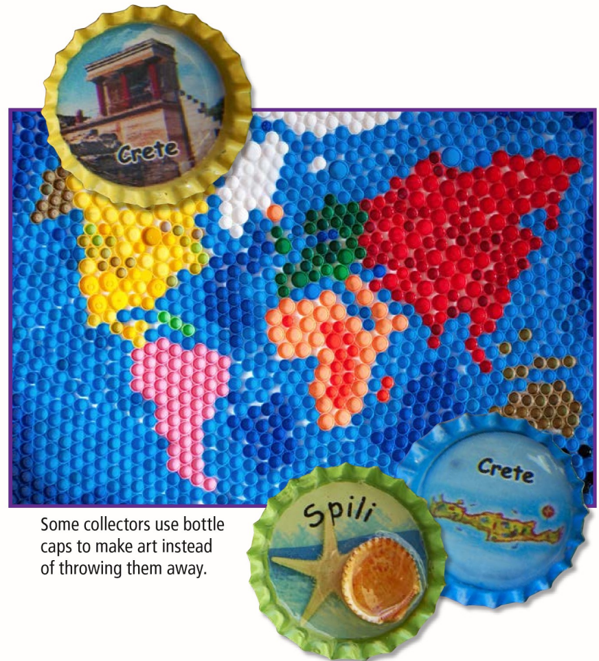
Some collectors use bottle caps to make art instead of throwing them away.

Many people use their collections to make new things. Some collectors make works of art, such as a map made out of bottle caps. Others make jewelry, like a necklace made from sea glass.