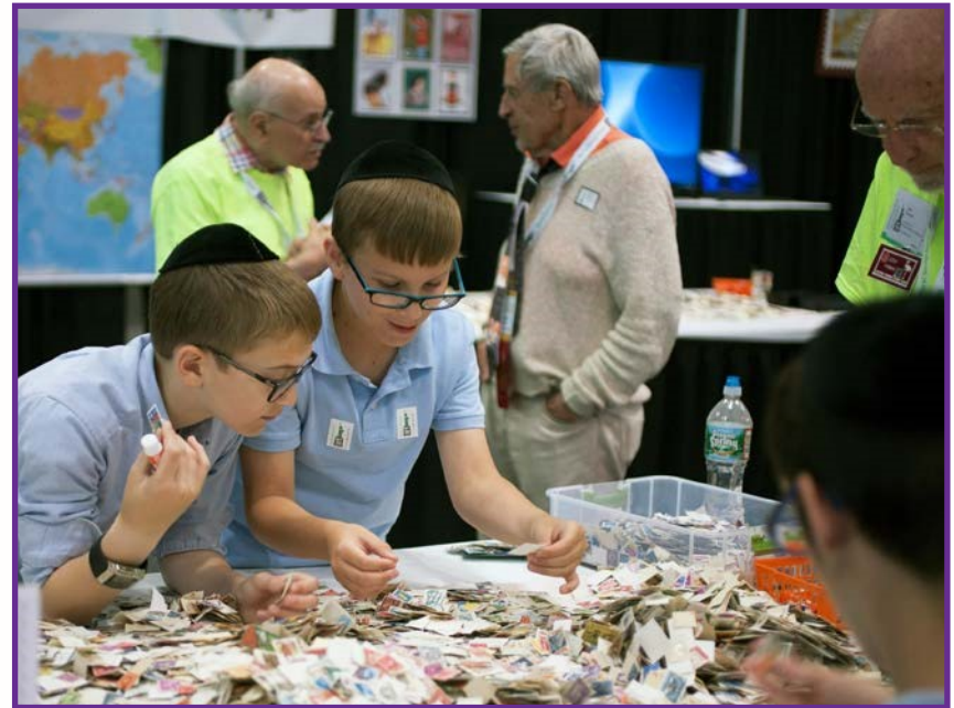
Two boys look through many stamps at the 2016 World Stamp Convention held in New York City.

Collections can be big or small. One person might have one hundred toy cars. Another person might have twenty sports cards.