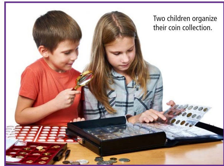
Two children organize their coin collection.