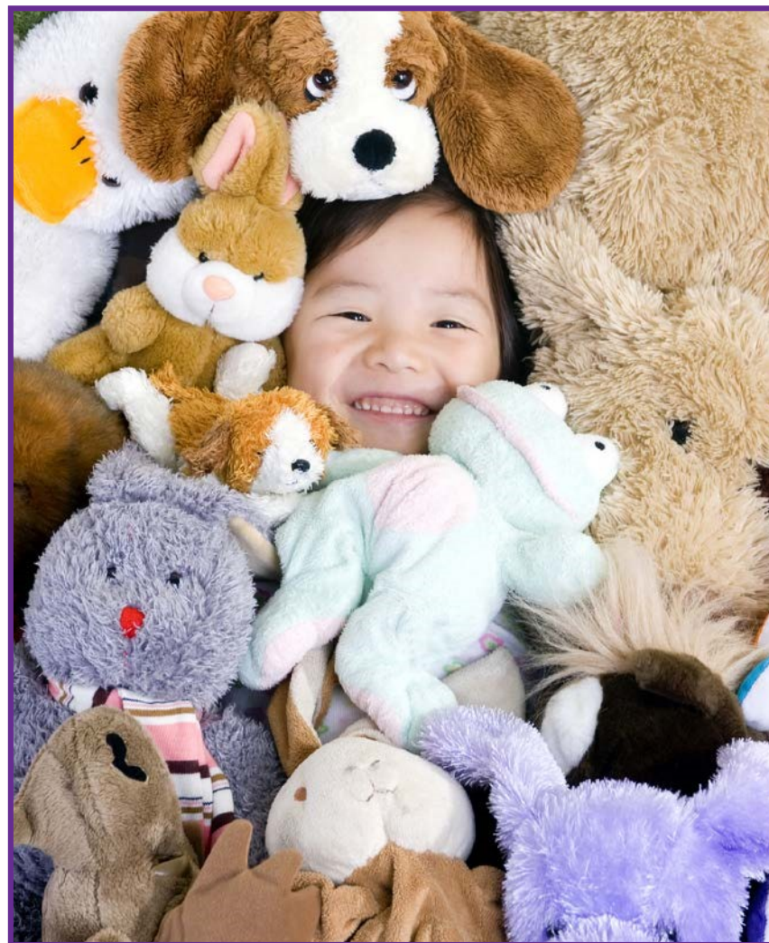
Both kids and adults enjoy collecting stuffed animals.